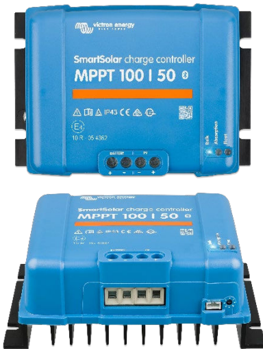
SmartSolar Charge Controller MPPT 100/50